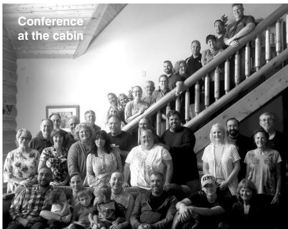
Conference at the cabin

You can rent a beautiful seven-bedroom, six-bathroom cabin with large meetings rooms, swimming, fishing, shooting, hunting, volleyball and basketball for our cost plus cleaning if you are an IMI partner. Call Tom at (612)202-6064 or contact Teresa through our listing on www.vrbo.com West Union, IA Cabin.