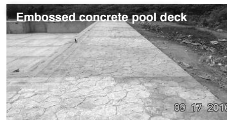
Embossed concrete pool deck