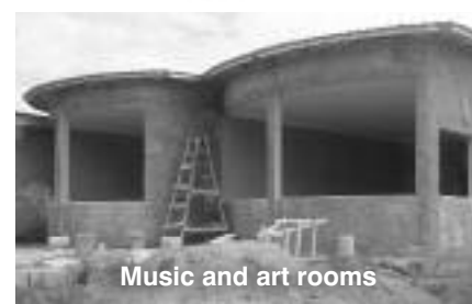
Music and art rooms