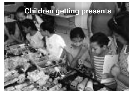
Children getting presents