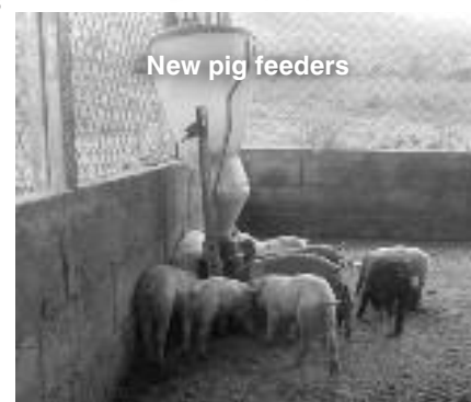
New pig feeders