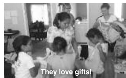
They love gifts!