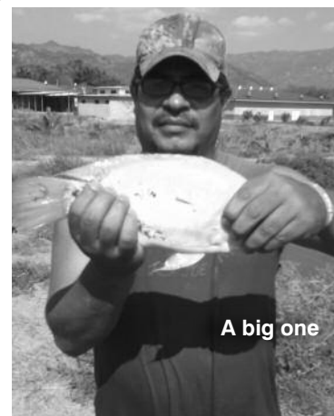
A big one