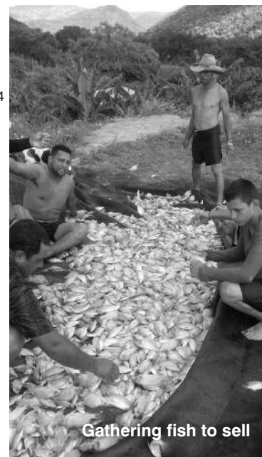
Gathering fish to sell