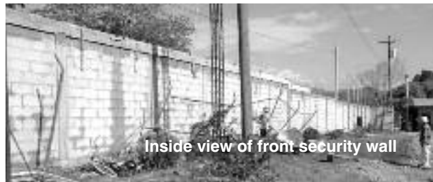
Inside view of front security wall