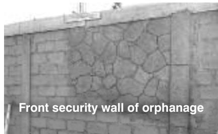
Front security wall of orphanage