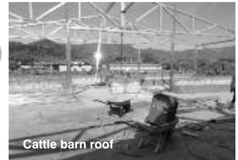
Cattle barn roof

Marriage "No relationship is all sunshine, but two people can share one umbrella and survive the storm together."