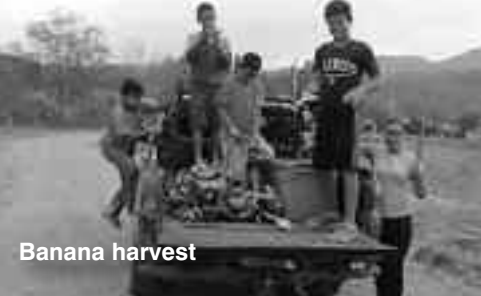
IMI fishermen Net profit Cleaning crew Banana harvest