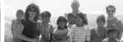
March ministry at the dump