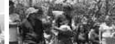
April ministry at the dump