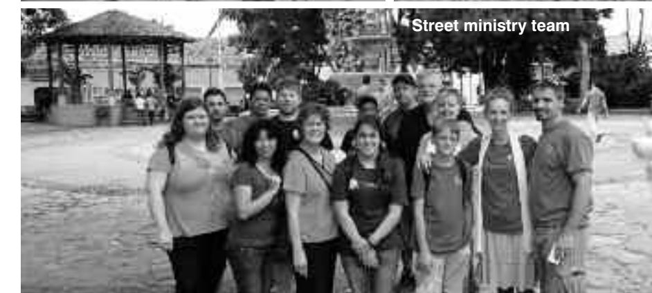
Street ministry team