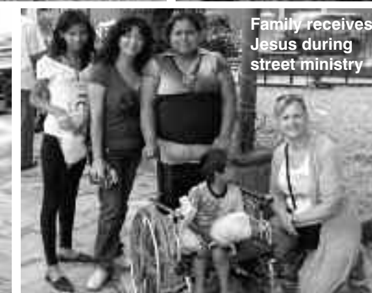
Family receives Jesus during street ministry