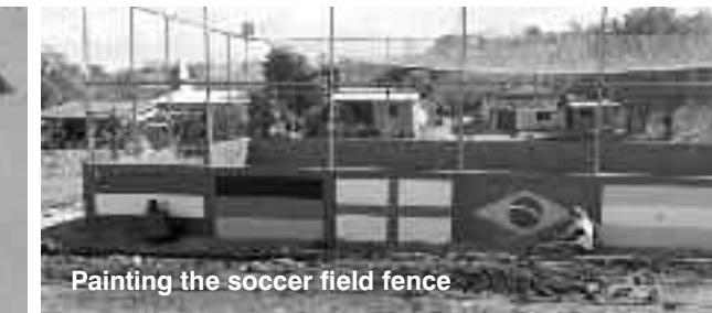
Painting the soccer field fence