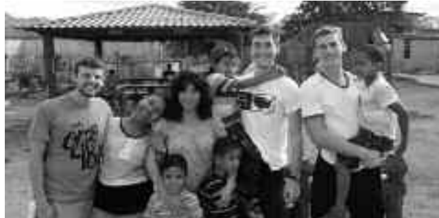
It was great to have our Great 48 bicycle-riding team join us on a mission trip in Honduras!