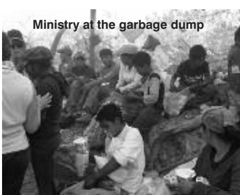
Ministry at the garbage dump

IMI burnt weeds and thorn bushes on 52 acres The purpose is to make room for the grass to grow for pasture. This will help make our land more productive by feeding more livestock to feed more children.