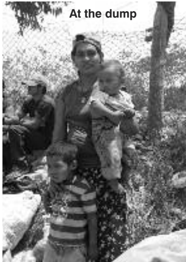
At the dump

IMI chicken barn is almost completed The big chicken barn with a hundred houses for our laying hens will be done soon. The building is 1,500 square feet. Thanks to the missionaries and our givers, we were able to build it. When the layers start doing their job, we won't have to buy eggs for the children. Currently, we are buying 2,000 eggs a month. All we have left to do is lay the cement and gravel. Then, we will be able to buy the chicks to raise so we can have over a hundred laying hens.