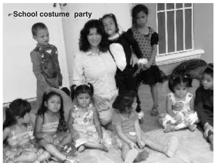
School costume party