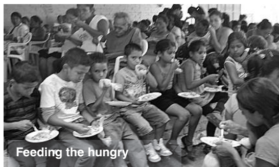
Feeding the hungry