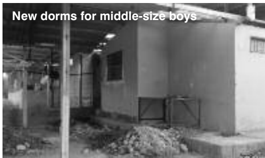
New dorms for middle-size boys