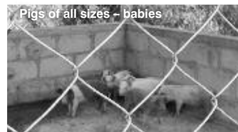
Pigs of all sizes - babies