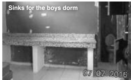
Sinks for the boys dorm