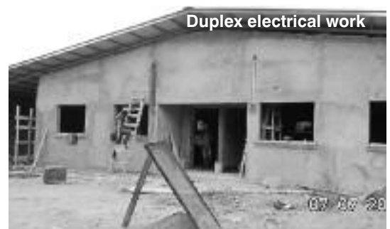
Duplex electrical work