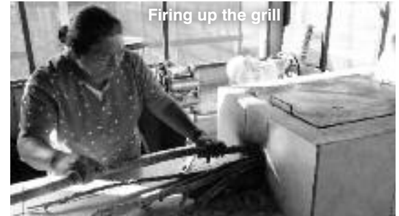
Firing up the grill