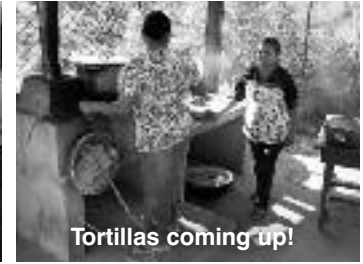
Tortillas coming up!