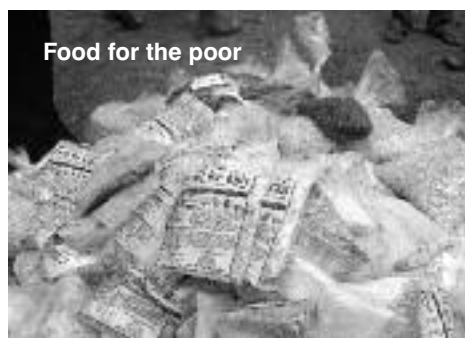
Food for the poor