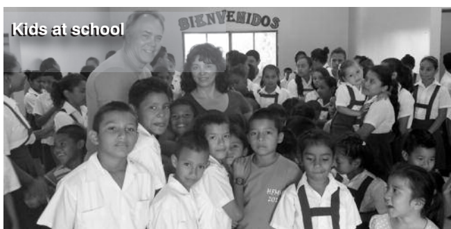
Kids at school