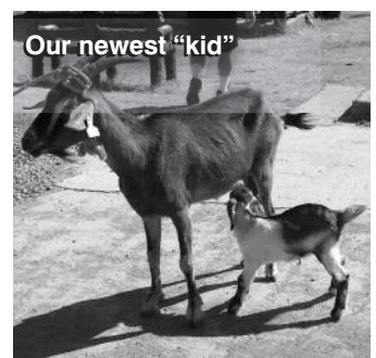
Our newest "kid"