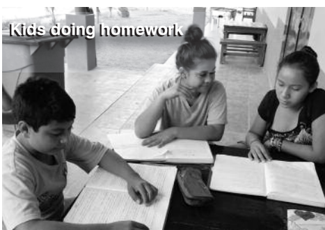
Kids doing homework