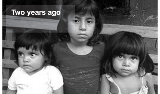
Two years ago