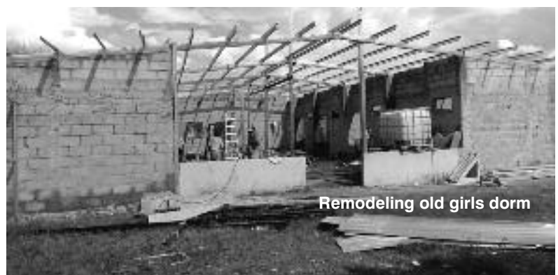
Remodeling old girls dorm