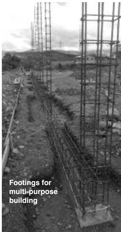
Footings for multi-purpose building

Souvenir shop – We hope to have it operational by December.