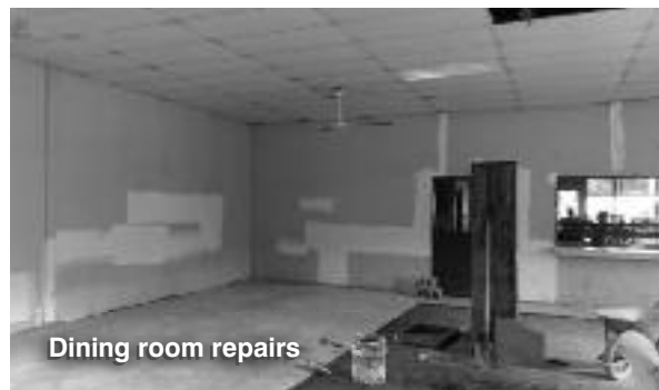
Dining room repairs