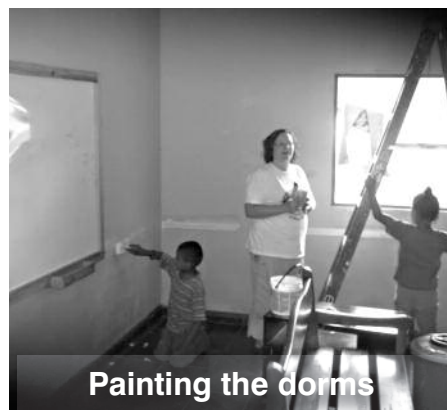
Painting the dorms